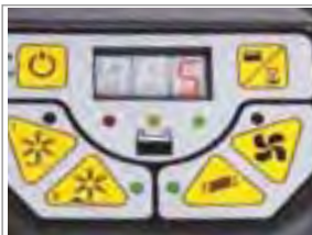
INTUITIVE CONTROL PANEL