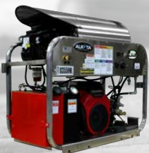
Honda Engine Stainless Steel Frame